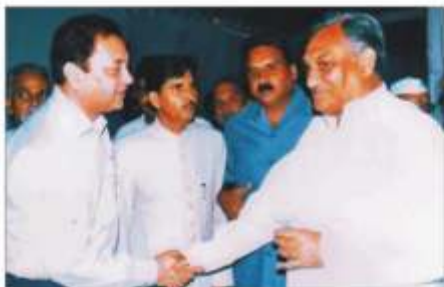
Secretary IMS - R welcoming Hon. Sri Vijay Bahuguna, C. M. Uttarakhand