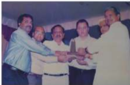
Hon. Sri Harish Rawat, Union Minister at IMS – R Campus