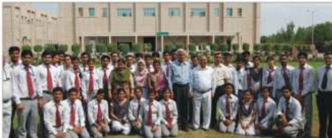
Industrial Visit to Patanjali Food Park, Haridwar