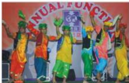
Students Perform at Annual Function - 2012