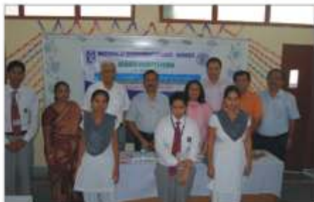
Rotary International debate at IMS - R Campus