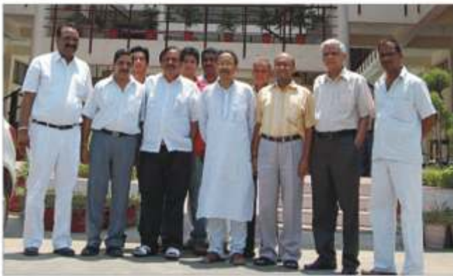
Visit of Maj. Gen. B. C. Khanduri, C.M. Uttarakhand